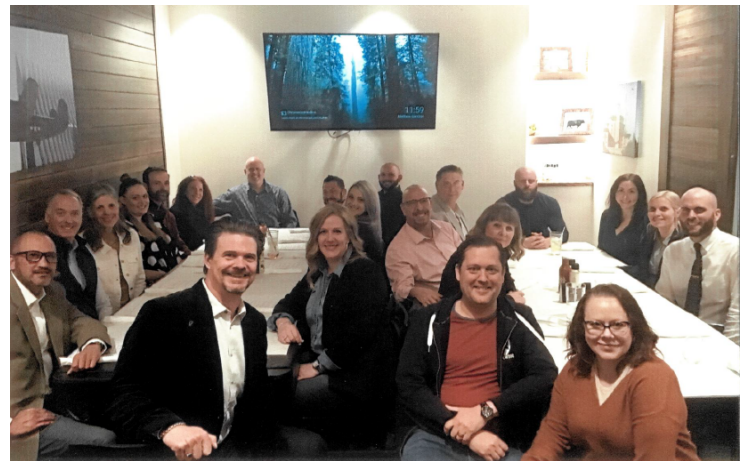
JFCC IMD Team Dinner on May 22nd in Colorado Springs, CO.

REAL ID is coming in 2023! Are you REAL ID ready? Beginning May 3, 2023, REAL IDs will be required to pass through airport security for all travelers 18 years old and older. The implementation deadline for the REAL ID—which was first slated to go into effect in the fall of 2020—has been extended several times due to the coronavirus pandemic.