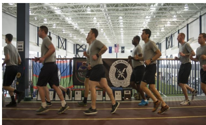
TACP Airmen memorialize the fallen

As our Qualis Cares "12 Months of Giving: A Lifetime of Making A Difference" service projects continue throughout this year, Qualis has chosen to contribute to several military causes this month thanks to your submissions. We are thankful for your ideas on ways to support great organizations and worthy causes in the places where we serve!