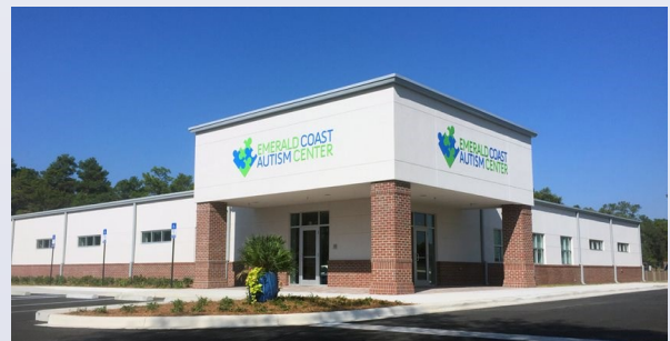
Emerald Coast Autism Center